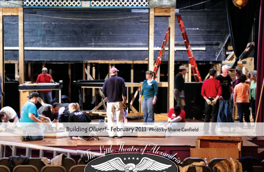
Building Oliver! - February 2011