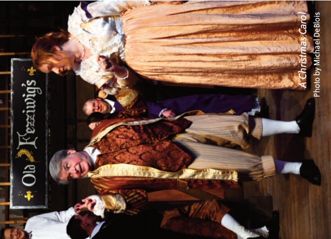
A Christmas Carol