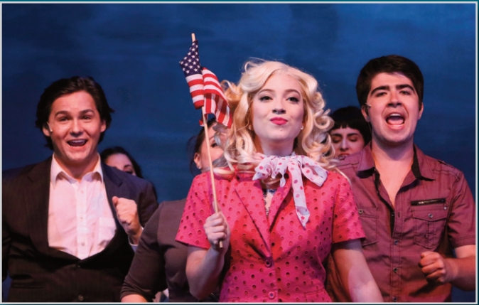
Legally Blonde – Photo by Matt Liptak