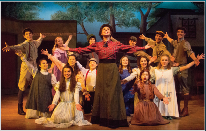
Anne of Green Gables