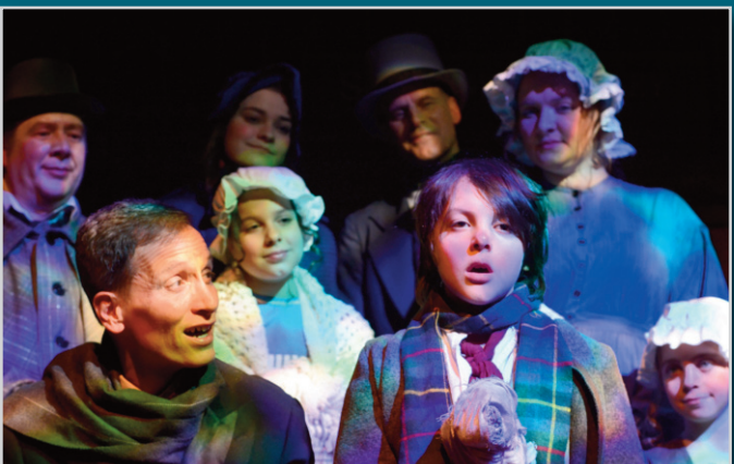
A Christmas Carol