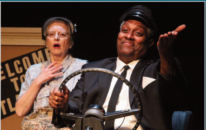
Driving Miss Daisy