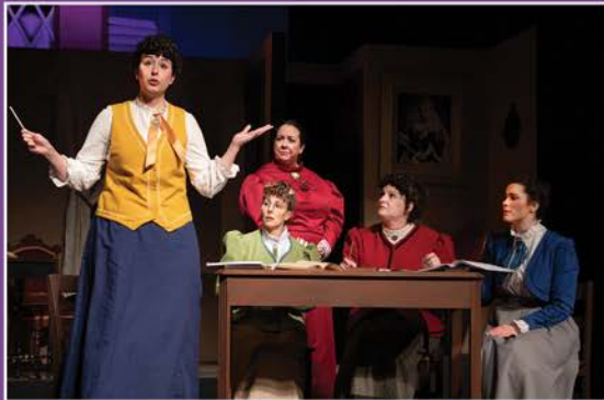
Blue Stockings – Photo by Matt Liptak