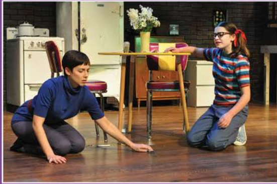
Wait Until Dark